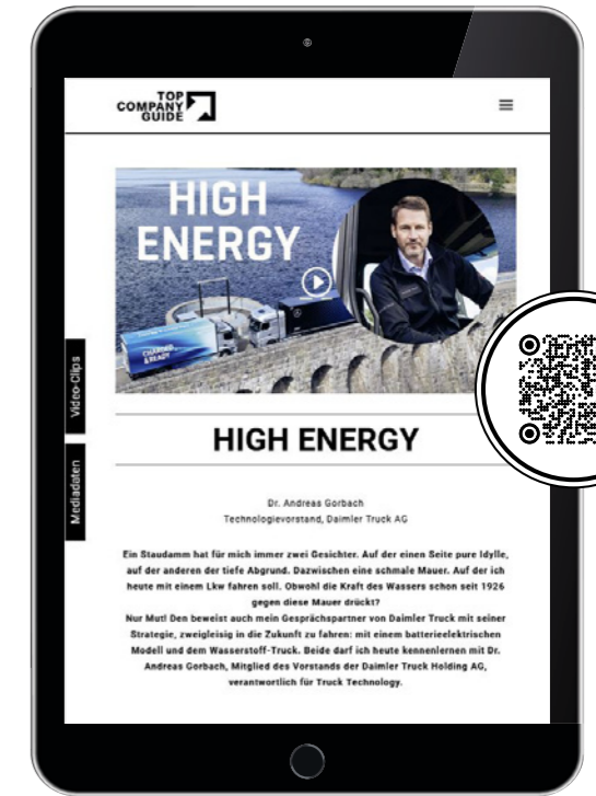
Driving Experience [online] + film clip