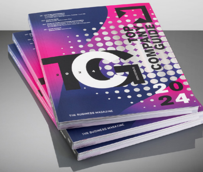
Top Company Guide: Print issue 2024