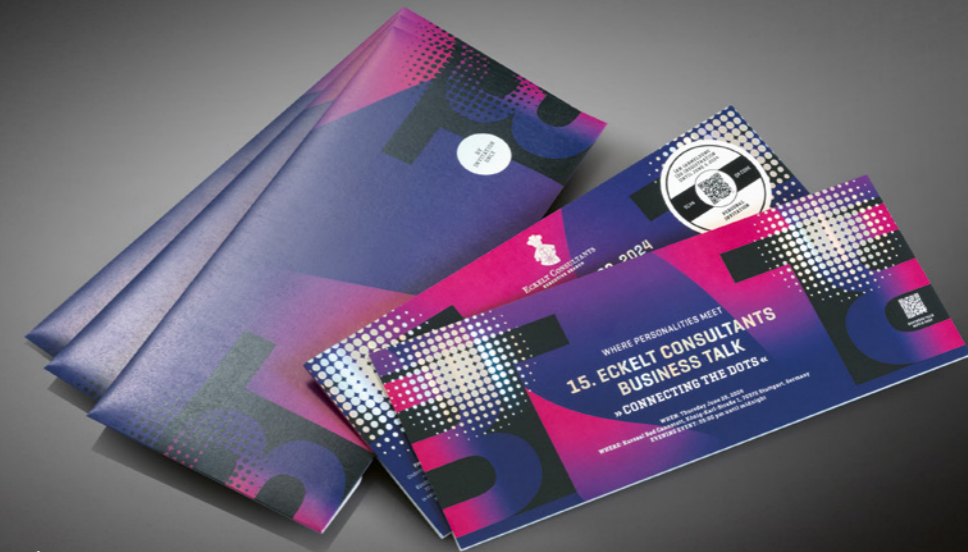
Personal invitation card

The Eckelt Consultants Business Talk is the event platform that connects outstanding personalities. Our declared mission: »Where personalities meet«. The new experience of top level networking. It helps leaders navigate competing priorities and pressures to deliver on both growth and the transition of their industries.