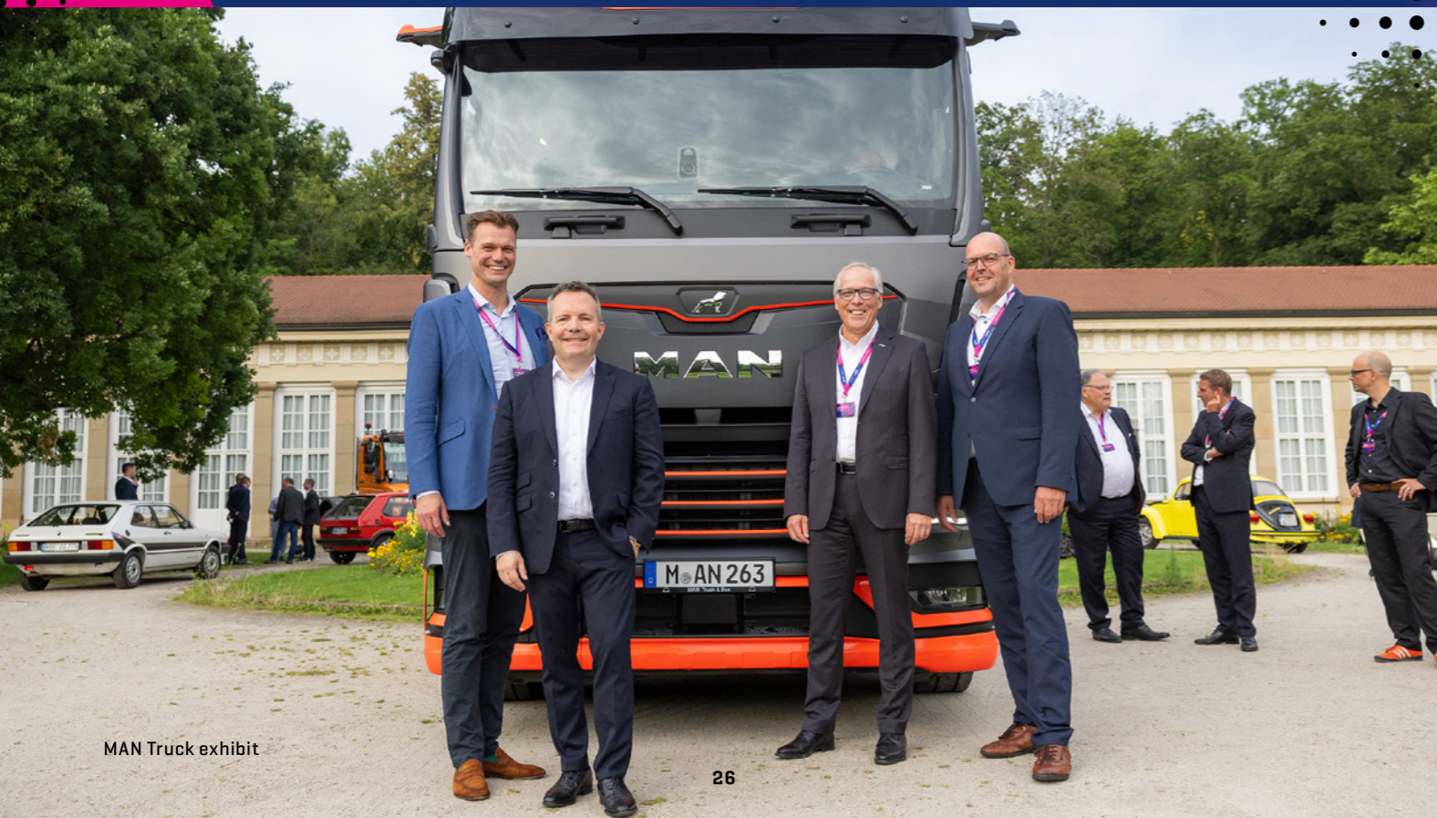
MAN Truck exhibit